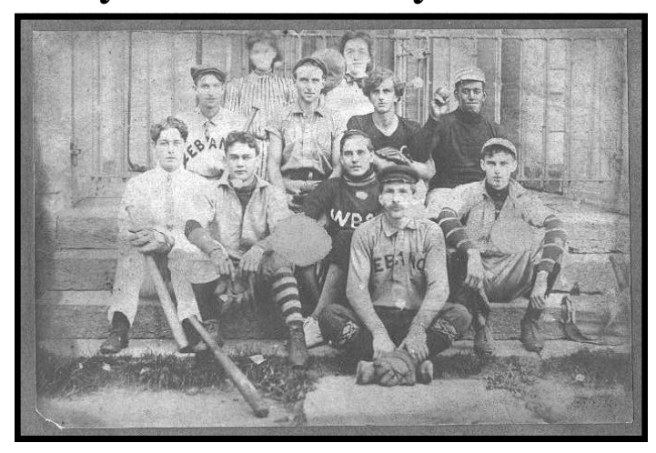
Unidentified baseball team from Lebanon

America's favorite pastime when he presents "Doubleday Didn't Do It: the History of Baseball before 1860" at the Lebanon Historical Society's annual meeting on May 5, 2010.